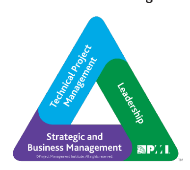
The PMI Talent Triangle®

Technical project management : Knowledge, skills and behaviors related to specific domains of Project, Program and Portfolio Management.